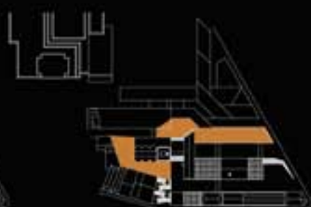
CREATION OF NEW PUBLIC CONNECTED SPACES