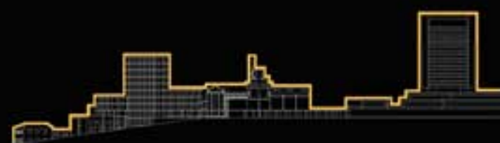
RESPECT THE BREAD FACTORY SKYLINE