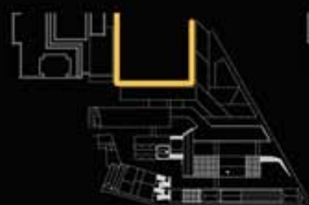
NEW FACADE TO DEFINE THE TOWN HALL SQUARE