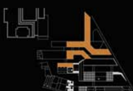
COVERED AREAS FOR RAIN PROTECTION